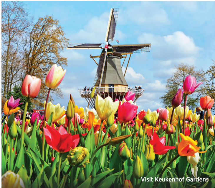
Visit Keukenhof Gardens

attracts art-lovers from all over the world. Enjoy a guided tour of the city center, with its café-lined cobbled lanes. Admire the Renaissance city hall and Hat Steen, a medieval fortress that was built during the early Middle Ages and one of the oldest buildings in Belgium. Afterwards, enjoy free time to explore Antwerp at your leisure.