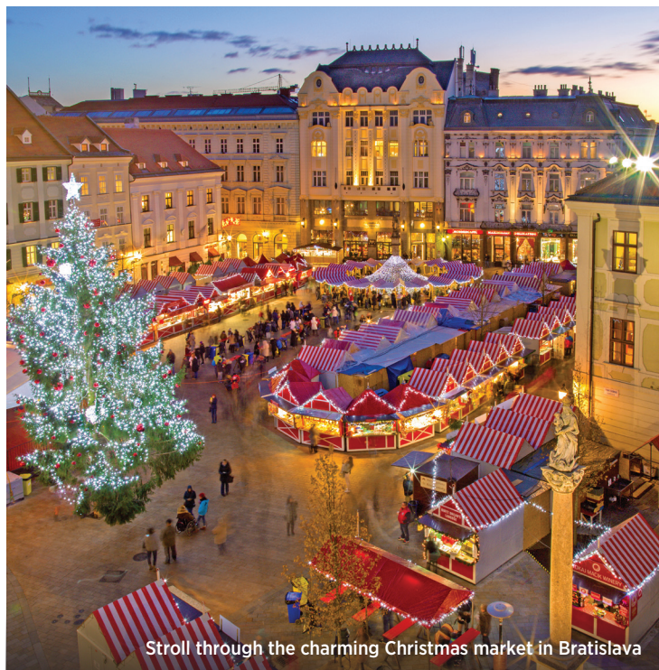
Stroll through the charming Christmas market in Bratislava

This important historic trading centre, known as the 'City of Three Rivers' – where three of Europe's main waterways converge – borders Austria and showcases a distinctive blend of cultures. Its beautiful historic centre features charming Baroque buildings, stunning riverside views and narrow cobblestone streets, all infused with the aroma of freshly baked gingerbread. In front of the green-domed façade of St. Stephen's Cathedral, Passau's annual Christkindlmarkt can be found. Here, you can sample some delicious warm Glühwein and freshly baked goods. Back on board your Emerald Star-Ship tonight, enjoy live local entertainment showcasing typical Bavarian musical traditions. Meals: B, L, D