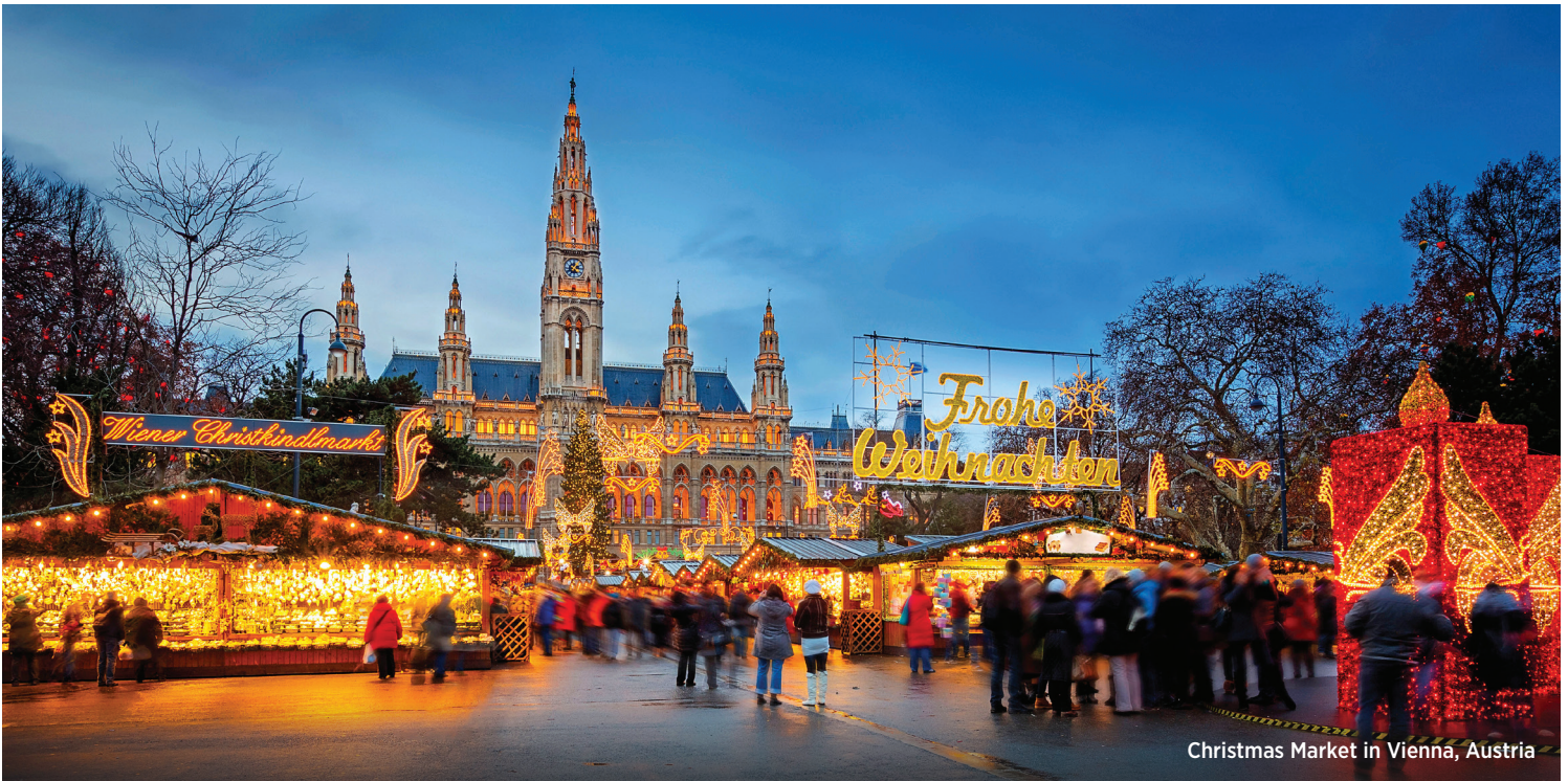
Christmas Market in Vienna, Austria