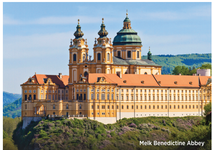
Melk Benedictine Abbey