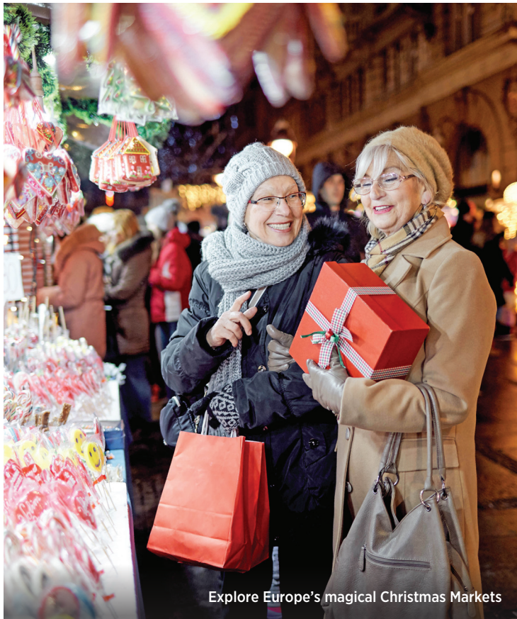
Explore Europe's magical Christmas Markets