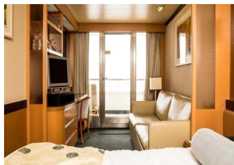
BALCONY CABIN $8,399.00 per person double Queen or 2 twin beds