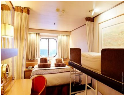
OCEANVIEW CABIN $7,399.00 per person double Queen or 2 twin beds