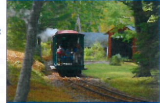
Visit to Boothbay Railway Village, including a vintage train ride