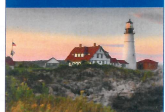
See the Portland Head Lighthouse

$200 Due Upon Signing. *Price per person, based on double occupancy. Add $409 for single occupancy. Final Payment Due: 3/23/2026