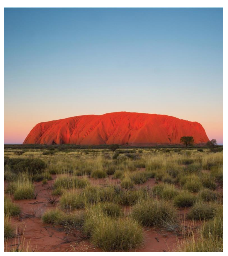
27 Days • 39 Meals: 24 Breakfasts, 4 Lunches, 11 Dinners

HIGHLIGHTS... Melbourne, Tasmanian Devils, Barossa Valley Wine Tasting, Uluru, Indigenous Pamagirri Experience, Great Barrier Reef, Sydney Opera House, Whakarewarewa Thermal Village, Kiwi Birds at Willowbank, Historic Port Arthur, Queenstown, Milford Sound