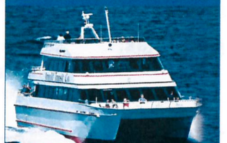
Mackinac Island Ferry

$200 Due Upon Signing. *Price per person, based on double occupancy. Add $219 for single occupancy. Final Payment Due: 6/30/2026