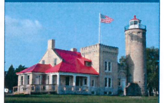
Mackinac Point Lighthouse