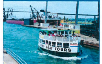
Soo Locks Cruise in Sault Sainte Marie