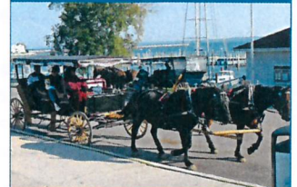
Tour Mackinac Island by Horse and Carriage

Day 6: Today you'll enjoy a Continental Breakfast and depart for home... a perfect time to chat with your friends about all the fun things you've done, the great sights you've seen and where your next group trip will take you!