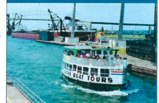
Soo Locks Cruise in Sault Sainte Marie