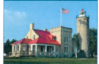
Mackinac Point Lighthouse