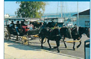
Tour Mackinac Island by Horse and Carriage

Day 6: Today you'll enjoy a Continental Breakfast and depart for home... a perfect time to chat with your friends about all the fun things you've done, the great sights you've seen and where your next group trip will take you!