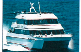
Mackinac Island Ferry

$200 Due Upon Signing. *Price per person, based on double occupancy. Add $219 for single occupancy. Final Payment Due: 3/25/2026