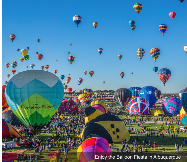
Enjoy the Balloon Fiesta in Albuquerque

DAY 1 Arrive in Utah: Welcome to Salt Lake City, Utah. Meet your Tour Manager at 6:00 p.m. for dinner with your traveling companions. Meal: D