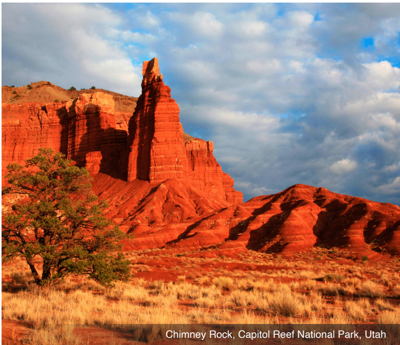
Chimney Rock, Capitol Reef National Park, Utah