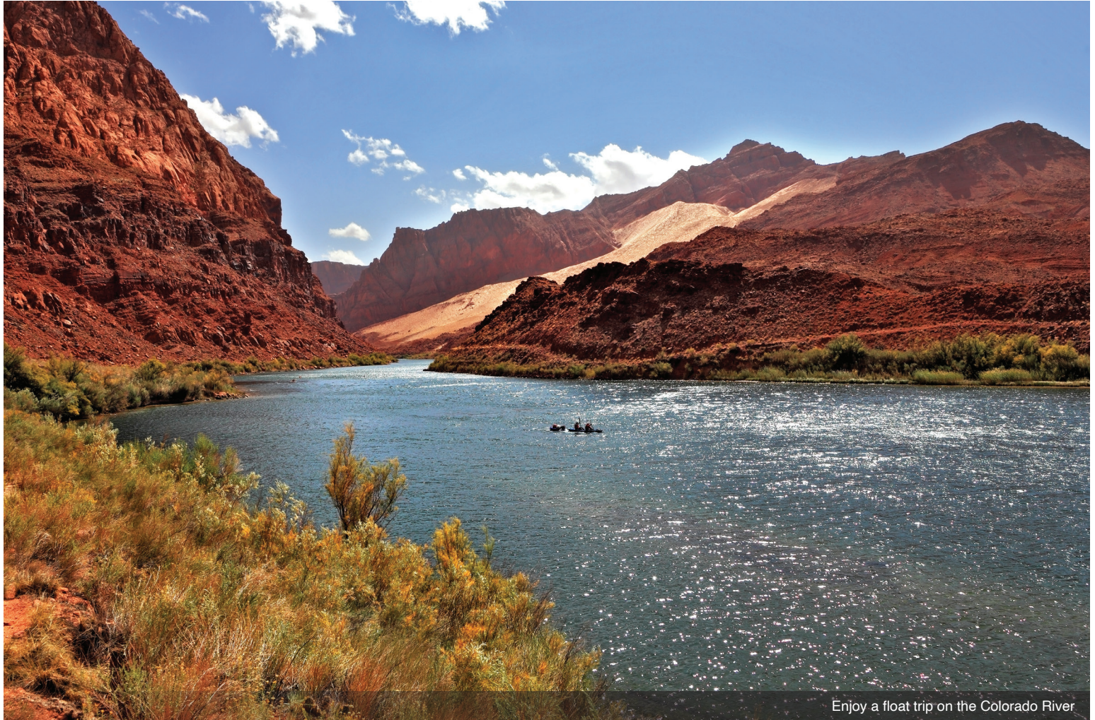
Enjoy a float trip on the Colorado River