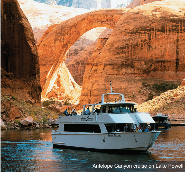
Antelope Canyon cruise on Lake Powell