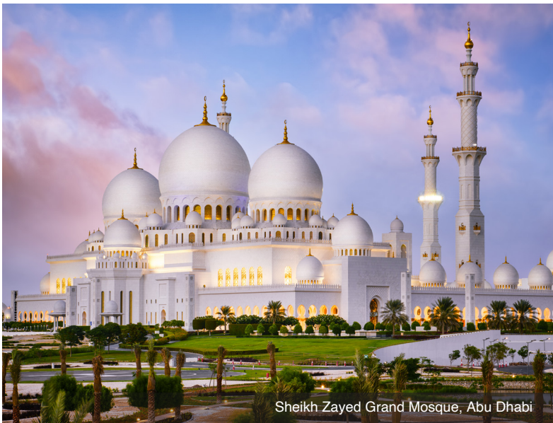
Sheikh Zayed Grand Mosque, Abu Dhabi

Sheikh Zayed Grand Mosque, one of the largest mosques in the world and an example of architectural styles from various Muslim civilizations. Featuring 82 domes, more than 1000 columns, 24-carat gold gilded chandeliers and the world's largest hand-knotted carpet, this mosque is a place of worship and cultural diversity. At Heritage Village, travel back in time to experience what life was like in the past as you visit this reconstruction of a traditional oasis village. See local items being hand-crafted from pottery to glassblowing and weaving. The traditional Souk resembles a bustling trading hub of days gone by and offers an opportunity to purchase locally made souvenirs. Enjoy a photo stop at Emirates Palace, the opulent, luxury hotel and experience the local flavor of the country with a stop at the Date market to savor the many varieties of dates from the region. Lunch is included at a local restaurant during the day, and dinner is included at the hotel this evening. Meals: B, L, D