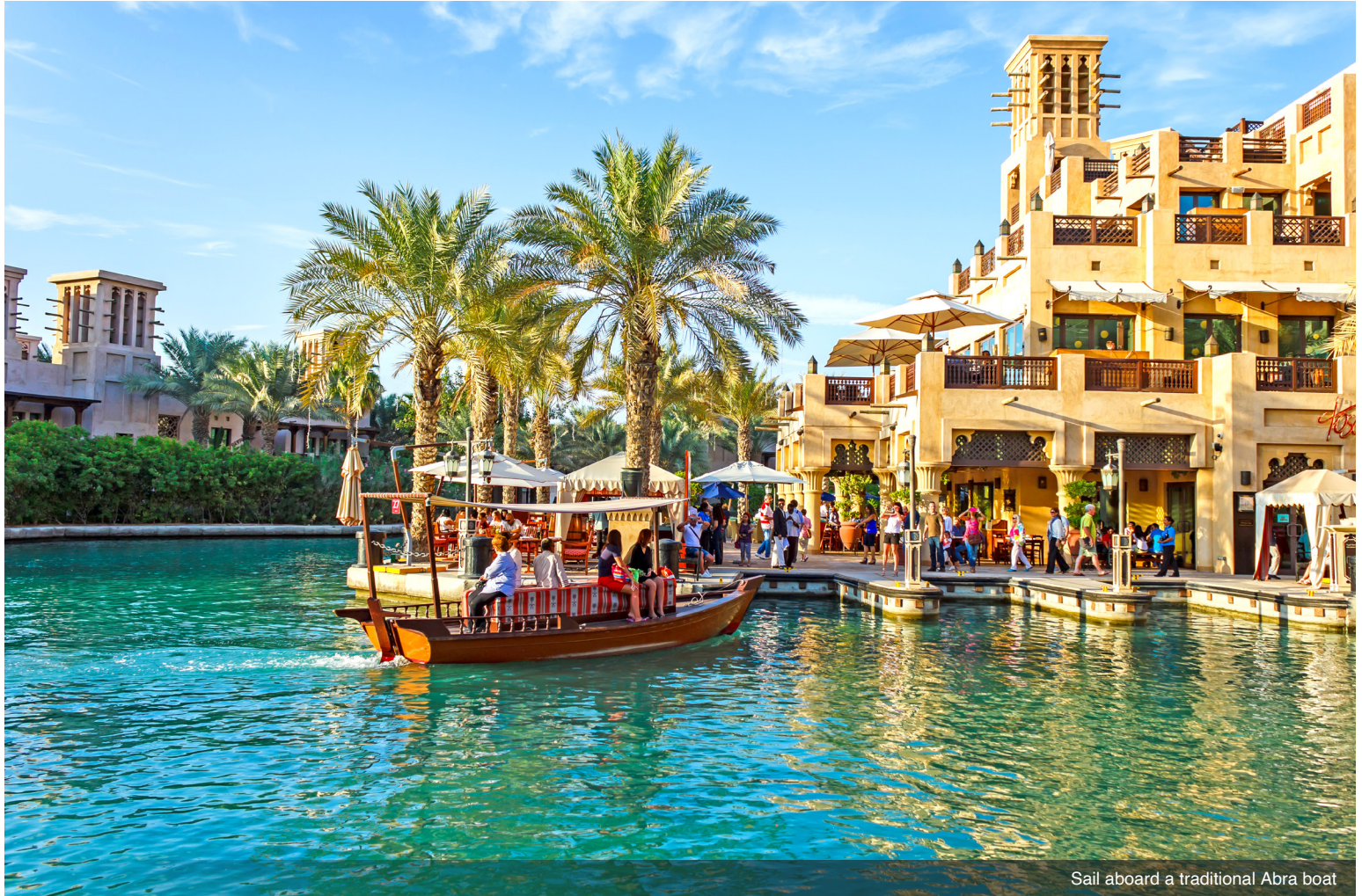
Sail aboard a traditional Abra boat