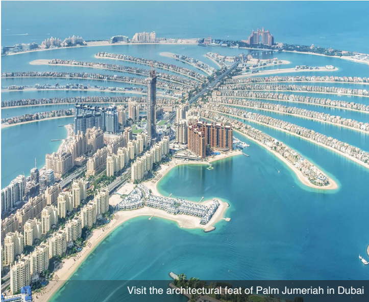
Visit the architectural feat of Palm Jumeriah in Dubai