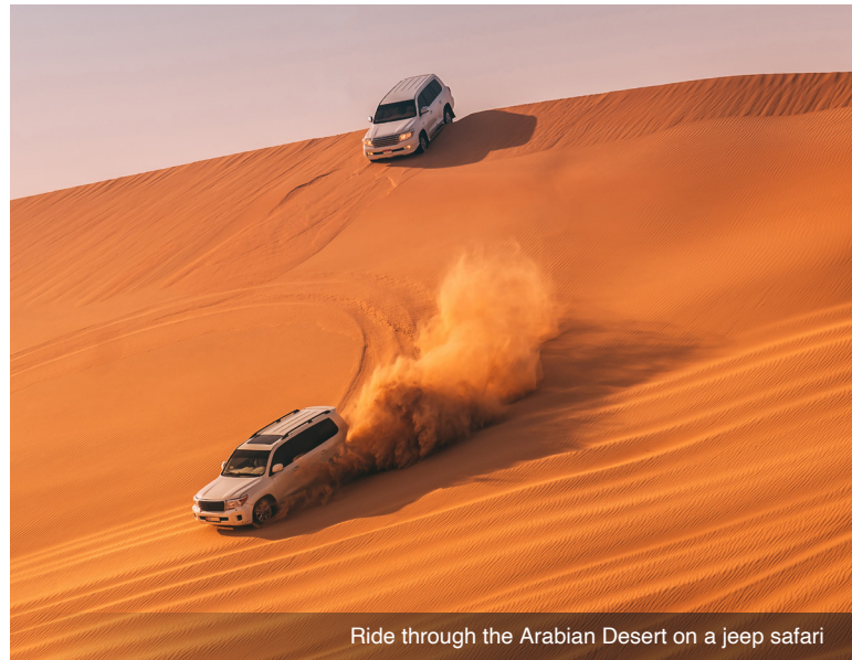
Ride through the Arabian Desert on a jeep safari

DAY 1 Depart the USA: Depart the USA on your overnight flight to Dubai, United Arab Emirates.