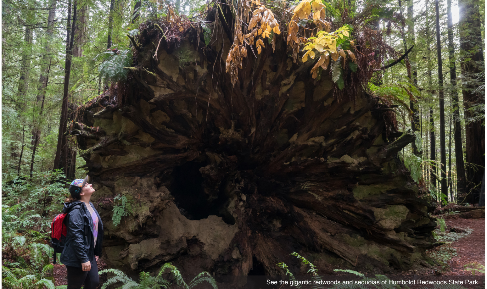
See the gigantic redwoods and sequoias of Humboldt Redwoods State Park