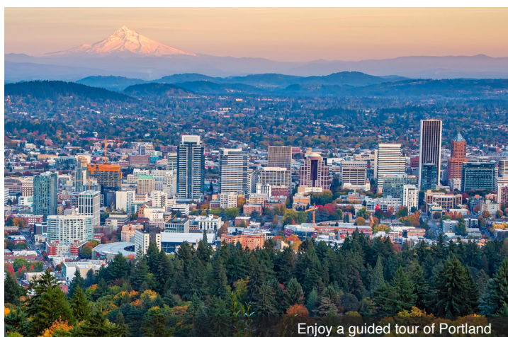
Enjoy a guided tour of Portland

DAY 10 Travel Home: Depart for home from this memorable vacation with a group transfer to Portland's International Airport for flights out after 12:00 p.m. Meal: B