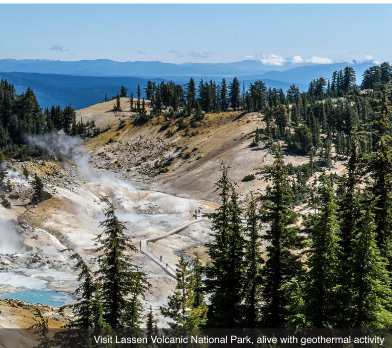
Visit Lassen Volcanic National Park, alive with geothermal activity

Then, make a stop at the unique North American Bigfoot Center featuring a wide array of bigfoot evidence and historical artifacts.