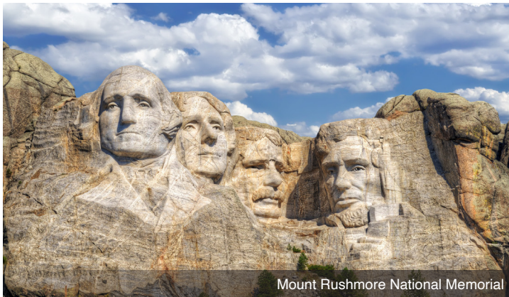
Mount Rushmore National Memorial

DAY 6 Travel Home: After breakfast, a group transfer to the Rapid City airport is available for flights out after 10:00 a.m. Meal: B