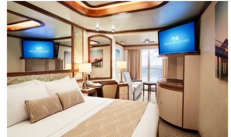
Mini Suite Stateroom