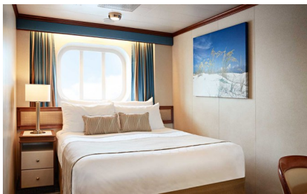
Ocean View Stateroom