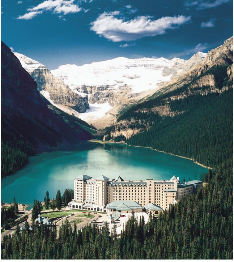
15 Days • 33 Meals: 14 Breakfasts, 9 Lunches, 10 Dinners

HIGHLIGHTS... Boundary Ranch, Lake Louise, Banff, Icefields Adventure Choice on Tour, Peyto Lake, Rocky Mountaineer, Kamloops, Grouse Mountain, Stanley Park, Vancouver, 7-Night Holland America Alaska Inside Passage Cruise