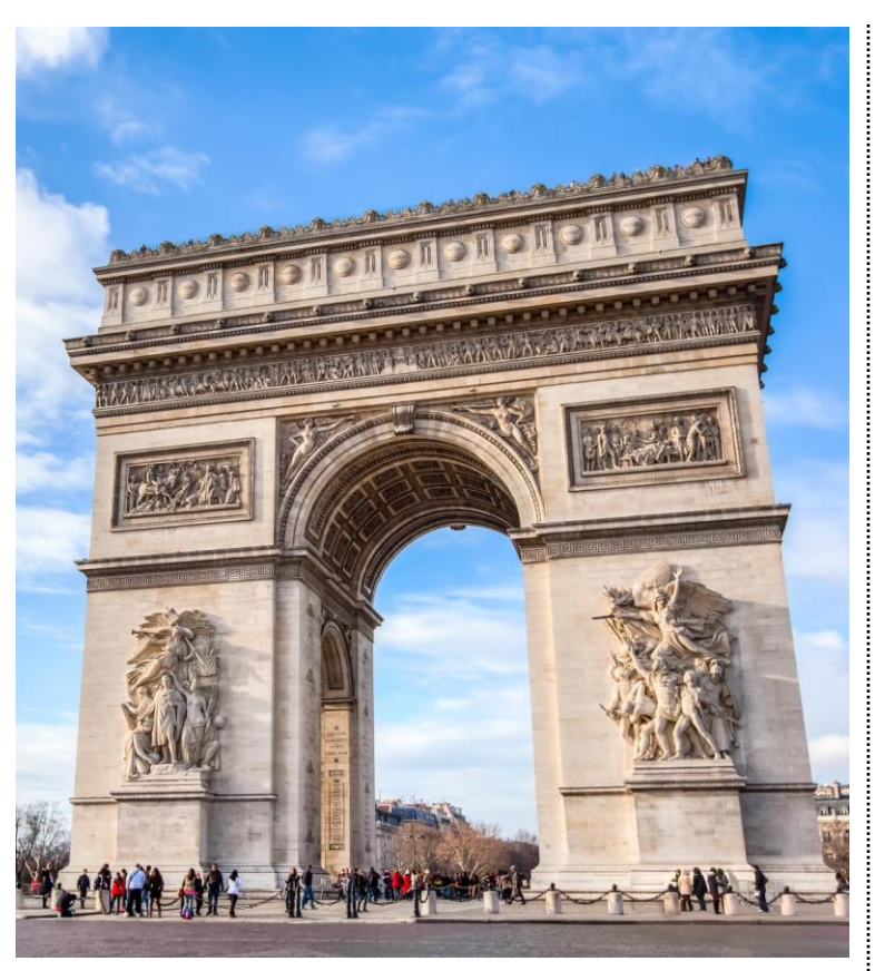
9 Days • 11 Meals: 7 Breakfasts, 1 Lunch, 3 Dinners

HIGHLIGHTS... Walking Tour in London, Traditional Fish & Chips Lunch, London Eye, Covent Garden, Eurostar Train, Choice on Tour: Paris City Tour by Bus or Montmartre by Metro Walking Tour, Arc de Triomphe, Eiffel Tower Dinner, Seine River Cruise