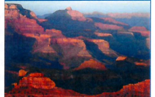
View the spectacular Grand Canyon