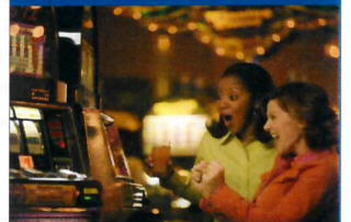
World-class Gaming and Excitement