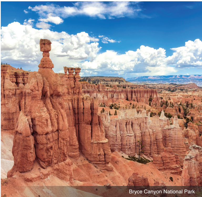
Bryce Canyon National Park

DAY 7 Homeward Bound: This morning a group transfer to Harry Reid International Airport is available for flights home departing after 12:00 p.m. Meal: B