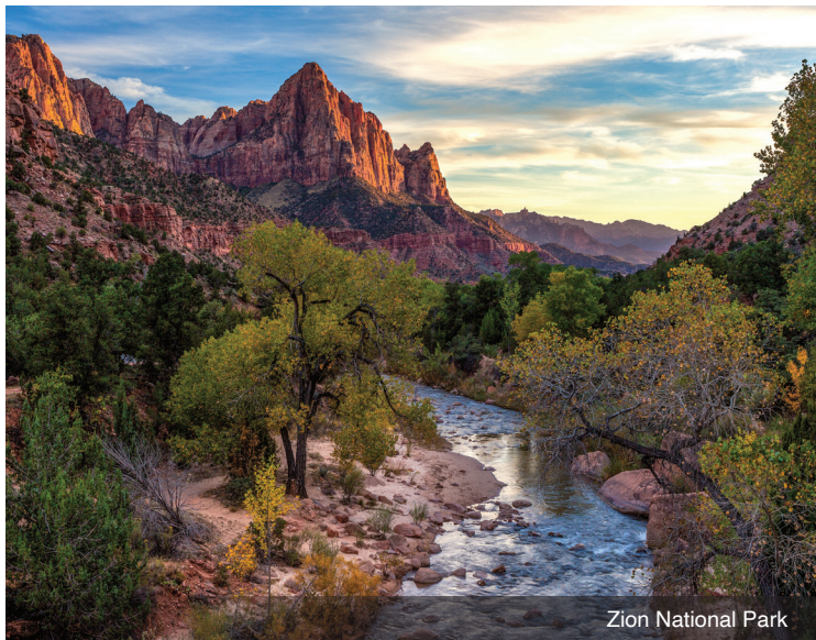
Zion National Park

Day 6 – Treasure Island, Las Vegas, Nevada