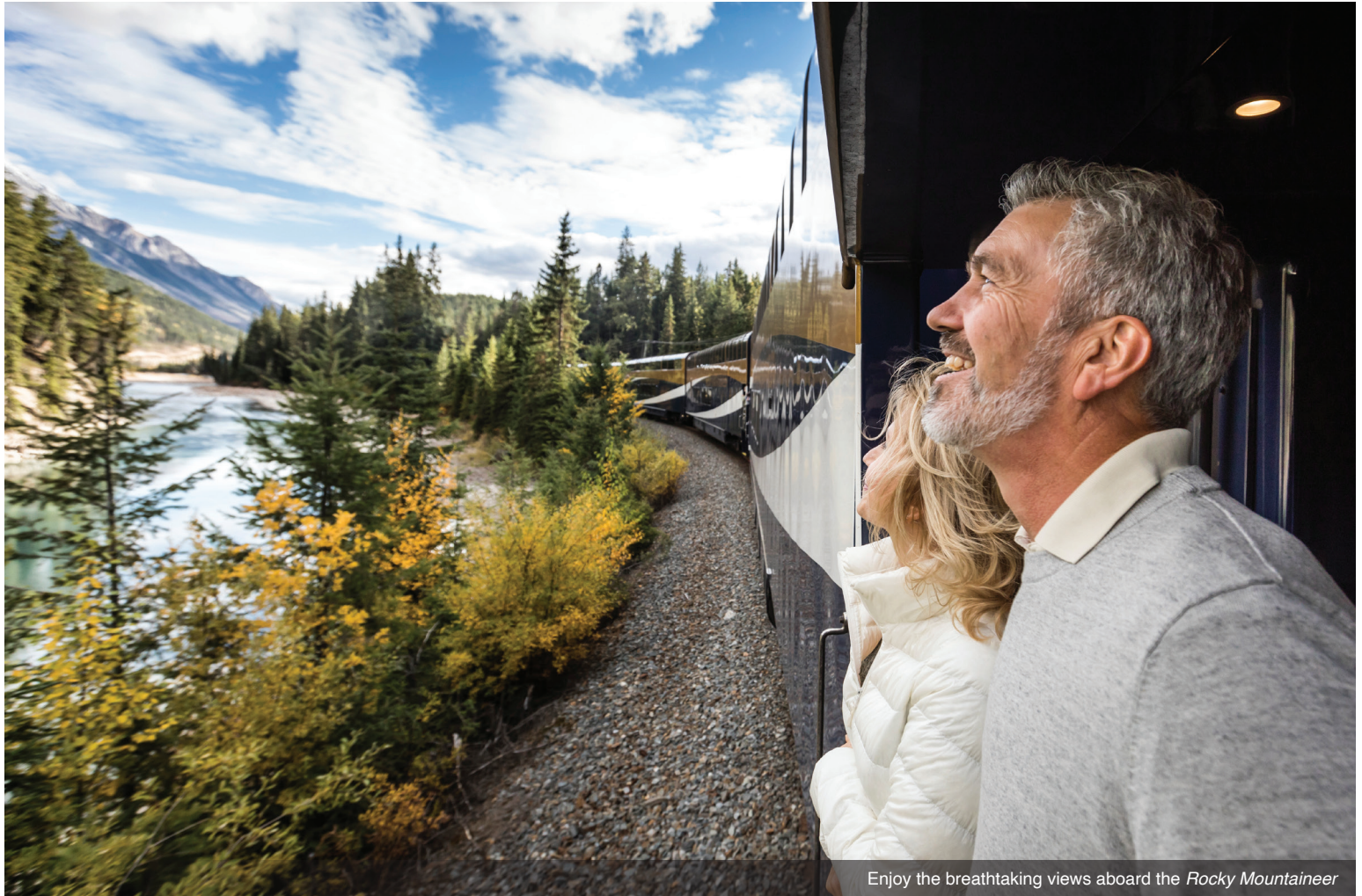
Enjoy the breathtaking views aboard the Rocky Mountaineer