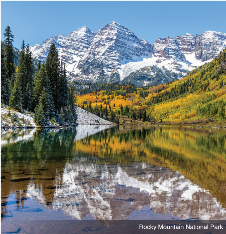
Rocky Mountain National Park