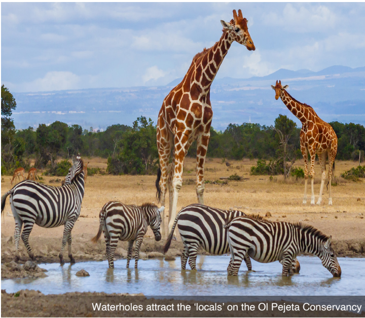
Waterholes attract the 'locals' on the OI Pejeta Conservancy