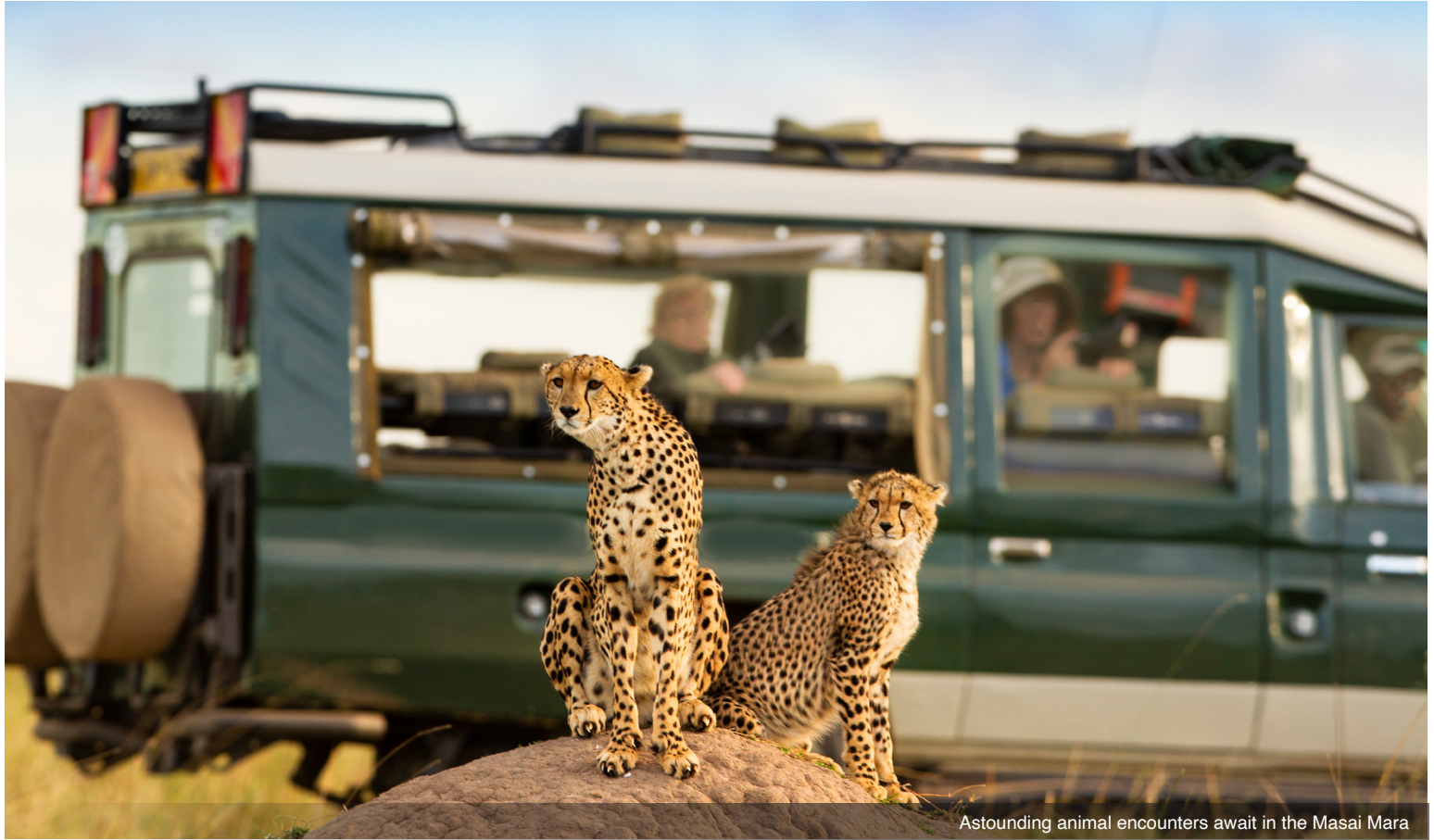
Astounding animal encounters await in the Masai Mara