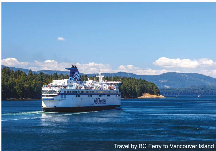
Travel by BC Ferry to Vancouver Island