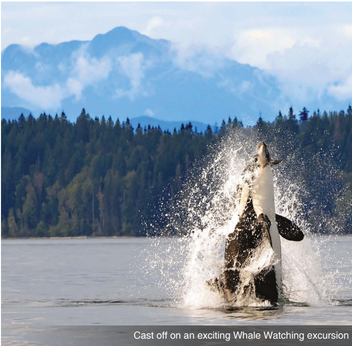
Cast off on an exciting Whale Watching excursion