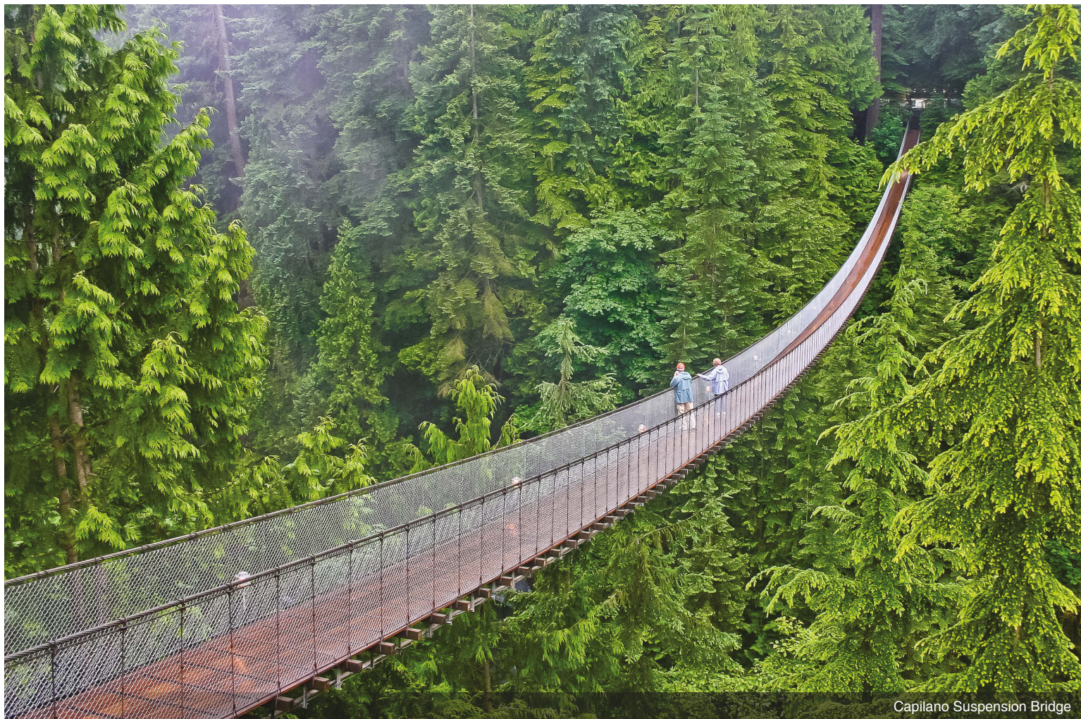
Capilano Suspension Bridge