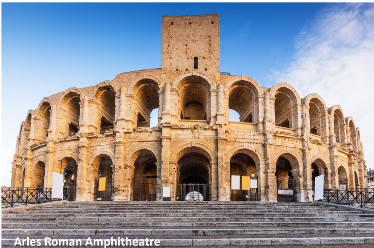
Arles Roman Amphitheatre