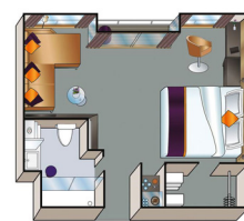
Suite Mozart Deck (284 sf)

All suites are on the Mozart Deck and have panoramic windows with exterior Walk Out Balcony, two twin beds that can be separated or put together, a private sitting area, flat screen TV, mini-bar, private bath with shower, hair dryer, phone, closet, desk, chair, safe & offer 284 square feet of floor space. (Suite size and amenities can vary)