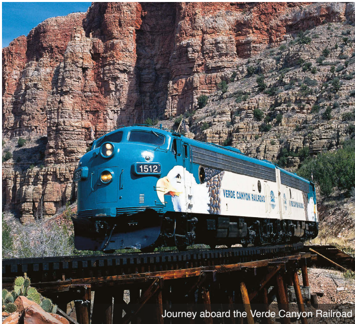
Journey aboard the Verde Canyon Railroad

DAY 5 Verde Canyon Railroad: This morning, stop in Jerome, an old mining town and melting pot for those who dreamed of making a quick fortune. Once virtually a ghost town, it is now restored with shops, museums and art. Later, climb aboard the Verde Canyon Railroad for a spectacular journey over old-fashioned trestles, past ancient Indian ruins and through a 700-foot tunnel. Enjoy the views from the comfort of your First Class seat or from one of the open-air viewing cars. Watch for wildflowers, blooming cacti and wildlife in their natural habitat. Tonight, chow down with a chuckwagon supper at the “Blazin’ M Ranch” and Western Stage Show. Meals: B, D